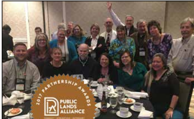
South Dakota representatives of Mount Rushmore, Jewel Cave, Wind Cave, Badlands, Black Hills National Forests and Devils Tower celebrate receiving a Public Lands Alliance 2017 Partnership Award for Public Engagement (Honorable Mention) for holding the first annual 2016 Find Your Park Festival last August.

Mount Rushmore Society, Black Hills Parks & Forests Association and Badlands Natural History Association) are in supplementing the budgets of our government agencies. As a