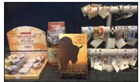
Mount Rushmore Memories now carries products by the Intertribal Buffalo Council.

still carry many items from our other local artists, including pottery, jewelry and artwork, as well as our original Mount Rushmore publications. Stop in and see us next time you fly out of Rapid City. Remember, your 15% membership discount applies here too!